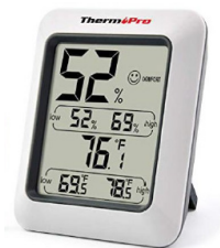
Hygrometer (measures humidity)