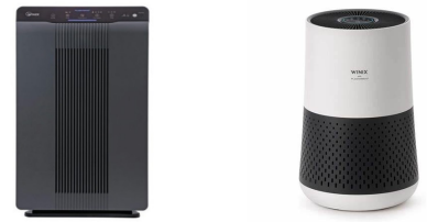
HEPA air purifiers