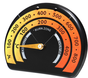
Wood stove thermometer