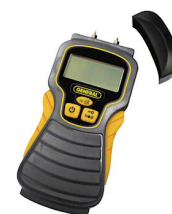
Moisture meter (for fire wood)