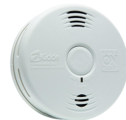
Combo smoke/carbon monoxide detector