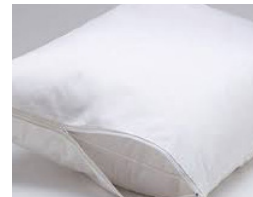
Allergen pillow cover